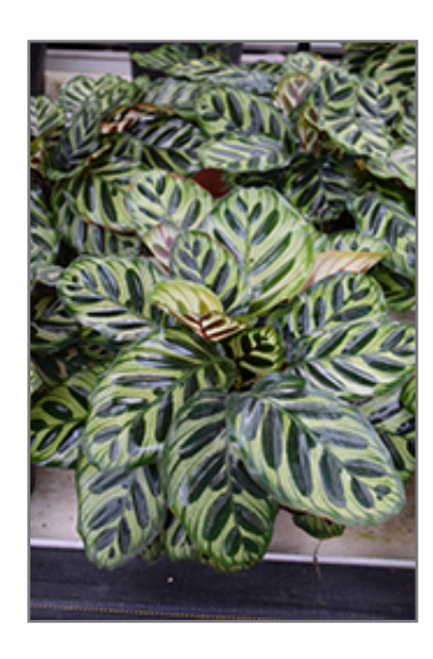
Color Full Makoyana Peacock Plant in full

A spectacular houseplant with elegant foliage that has bold, feather-like markings above, and burgundy undersides with a hint of pink; requires consistent moisture and humidity, mist with distilled water frequently in drier environments