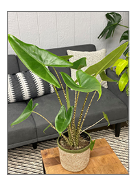
Mythic Zebrina Elephant Ears in full

This gorgeous Alocasia features deep green, shiny, heart shaped leaves, rising up on striking black and white mottled petioles that resemble zebra stripes; a stunning tropical accent plant for indoor areas with bright, indirect light