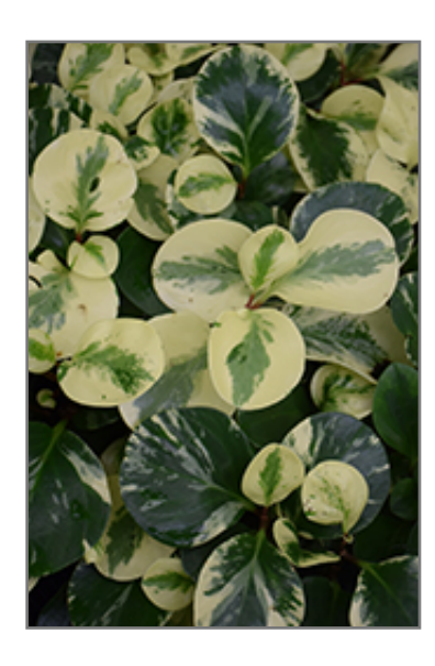
Variegated Baby Rubber Plant foliage

This is an herbaceous evergreen houseplant with an upright spreading habit of growth. This plant should not require much pruning, except when necessary to keep it looking its best.