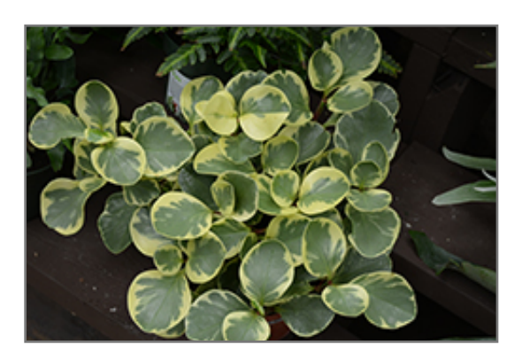
Variegated Baby Rubber Plant in full