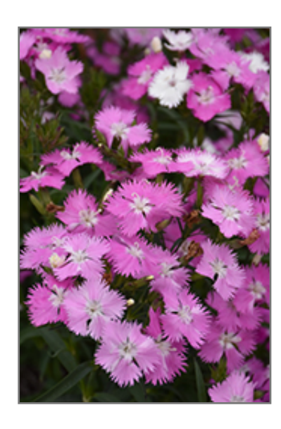
First Love Pinks flowers

A stunning variety where the flowers emerge white, turn to pink and finally develop to lavender-rose when mature; blanketing mounds of silvery-blue foliage throughout summer months; deadhead to encourage blooms; perfect in borders, beds and containers