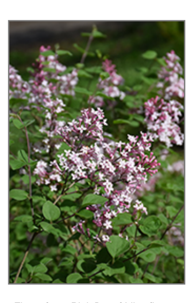
Flowerfesta Pink Dwarf Lilac flowers

A compact, reblooming selection, featuring lovely spikes of fragrant lilac-pink flowers in early summer, then again in autumn; small rounded foliage and a uniform shape that is neat and tidy; great for containers or massing; full sun and well-drained soil