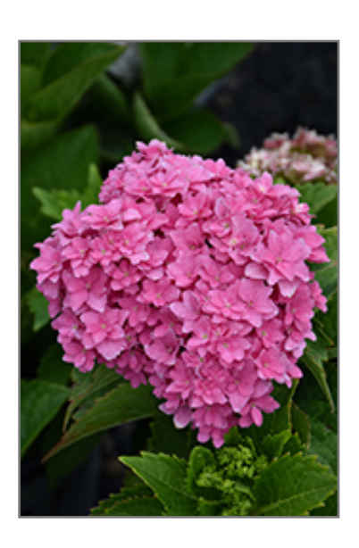
Starfield Hydrangea flowers

Starfield Hydrangea will grow to be about 3 feet tall at maturity, with a spread of 3 feet. It tends to be a little leggy, with a typical clearance of 1 foot from the ground. It grows at a fast rate, and under ideal conditions can be expected to live for approximately 20 years.