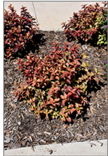
Midnight Sun Reblooming Weigela