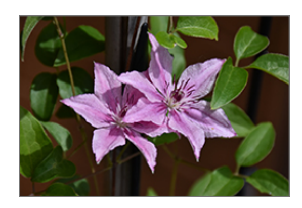
Pink Fantasy Clematis flowers

A new and exciting clematis with soft pink flowers imbued with shades of richer and deeper pink throughout; a vigorous and prolific bloomer, just the plant to add softness and color to a fence, arbor or other structure