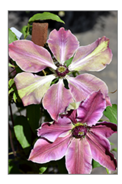
Lincoln Star Clematis flowers

Lincoln Star Clematis features bold cherry red star-shaped flowers with white eyes and pink edges at the ends of the branches from early to late summer. It has green deciduous foliage. The compound leaves do not develop any appreciable fall colour.