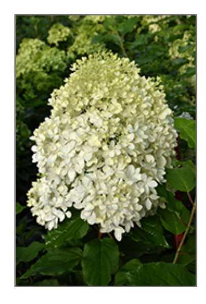
Puffer Fish Hydrangea flowers

This shrub will require occasional maintenance and upkeep, and is best pruned in late winter once the threat of extreme cold has passed. It has no significant negative characteristics.