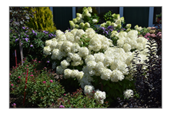
Puffer Fish Hydrangea in bloom

Puffer Fish Hydrangea is recommended for the following landscape applications;