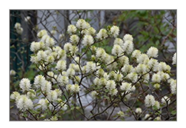
Legend Of The Fall Fothergilla flowers

A versatile and trouble-free landscape shrub; features honey scented, showy white "bottle-brush" flowers in spring, and spectacular fall color; very shade tolerant and thrives in hot climates; prefers light acidic soils; great for planting under trees