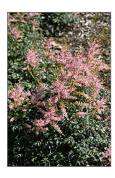
Hennie Graafland Astilbe flowers

A low maintenance, shade loving variety, featuring upright-mounded plants; soft pink plumes rise above mounds of ferny, toothed foliage; an excellent addition to shaded gardens, borders, containers or fresh-cut bouquets; low maintenance