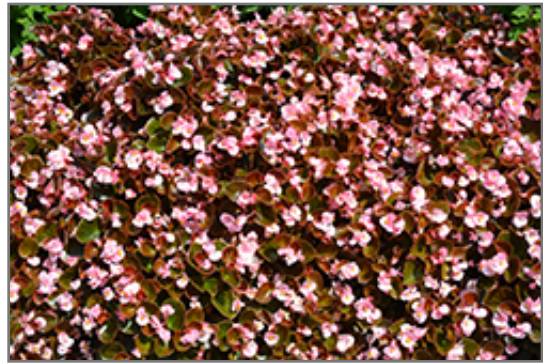
Cocktail Brandy Begonia flowers

Cocktail Brandy Begonia is a fine choice for the garden, but it is also a good selection for planting in outdoor containers and hanging baskets. It is often used as a 'filler' in the 'spiller-thriller-filler' container combination, providing a mass of flowers and foliage against which the thriller plants stand out. Note that when growing plants in outdoor containers and baskets, they may require more frequent waterings than they would in the yard or garden.