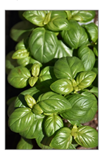
Everleaf Emerald Towers Basil foliage