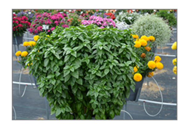
Everleaf Emerald Towers Basil

Everleaf Emerald Towers Basil will grow to be about 24 inches tall at maturity, with a spread of 12 inches. When grown in masses or used as a bedding plant, individual plants should be spaced approximately 12 inches apart. This fast-growing annual will normally live for one full growing season, needing replacement the following year.