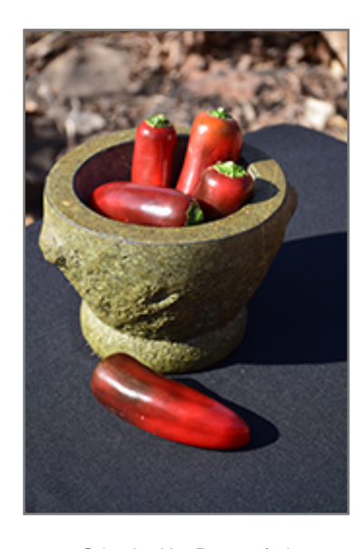
Sriracha Hot Pepper fruit

A high yielding upright variety, known for its popular hot sauce; jalapeno type peppers develop from green to red when mature; firm and thick walled with a spicy flavor and nice crunch; delicious fresh, roasted, dried to made into hot sauce