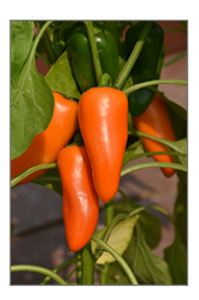
Fresh Bites Orange Sweet Pepper fruit

Fresh Bites Orange Sweet Pepper will grow to be about 12 inches tall at maturity, with a spread of 8 inches. This vegetable plant is an annual, which means that it will grow for one season in your garden and then die after producing a crop.