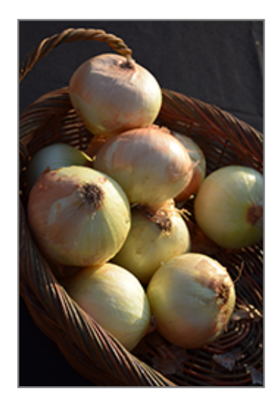
Candy Onion fruit

An early maturing variety, perfect for kitchen gardens and containers; produces light golden yellow, 4" wide, globe shaped onions with large, thick rings; plant in early spring or fall; sweet and mild flavor, great for salads, onion rings, soups and dips