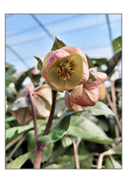
HGC Ice N' Roses Bianco Hellebore flowers

This attractive variety produces bushy mounds of thick evergreen leaves; flower stalks, held above the foliage bear showy, cup shaped, white blooms with pink highlights and pale yellow anthers; a great selection for shade gardens