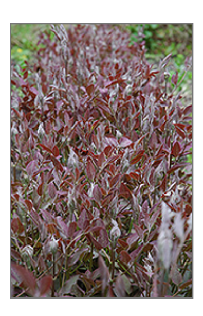
Purple Ground Clematis foliage