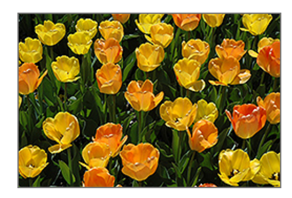
Daydream Tulip flowers

This is a relatively low maintenance plant, and should not require much pruning, except when necessary, such as to remove dieback. It has no significant negative characteristics.