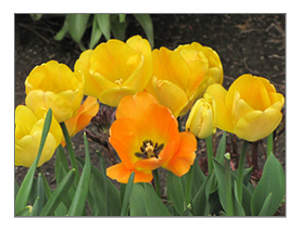
Daydream Tulip in bloom

Daydream Tulip is recommended for the following landscape applications;