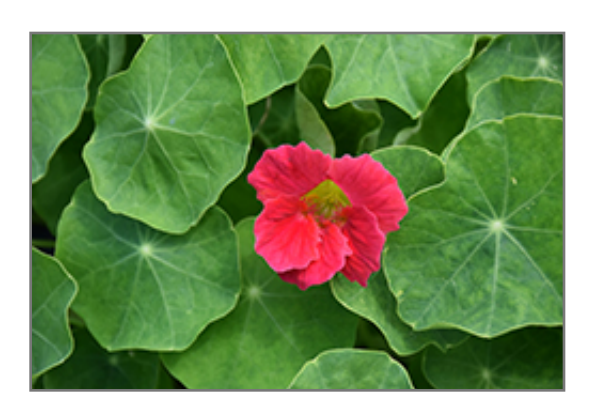
Whirlybird Cherry Rose Nasturtium flowers

This stunning variety features edible cherry pink blooms contrasting against grey-green foliage; compact mounded habit, excellent for patio containers, hanging baskets and borders; flowers, with a peppery flavor, make a great addition to salads