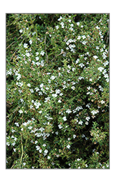
Winter Savory flowers