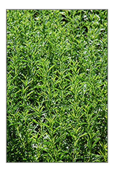
Winter Savory