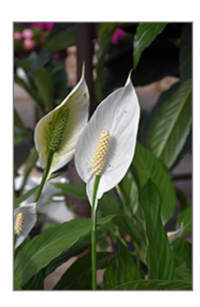
Peace Lily flowers

When grown indoors, Peace Lily can be expected to grow to be about 30 inches tall at maturity, with a spread of 30 inches. It grows at a medium rate, and under ideal conditions can be expected to live for approximately 10 years. This houseplant performs well in both bright or indirect sunlight and strong artificial light, and can therefore be situated in almost any well-lit room or location. It prefers to grow in average to moist soil. The surface of the soil shouldn't be allowed to dry out completely, and so you should expect to water this plant once and possibly even twice each week. Be aware that your particular watering schedule may vary depending on its location in the room, the pot size, plant size and other conditions; if in doubt, ask one of our experts in the store for advice. It is particular about its soil conditions, with a strong preference for rich, acidic soil. Contact the store for specific recommendations on pre-mixed potting soil for this plant. Be warned that parts of this plant are known to be toxic to humans and animals, so special care should be exercised if growing it around children and pets.