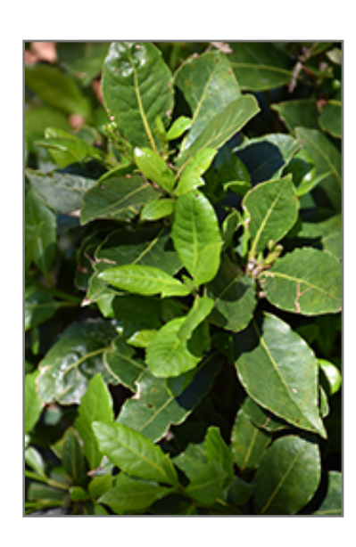
Pride of Provence Bay Laurel foliage

Pride of Provence Bay Laurel's attractive glossy oval leaves remain forest green in colour throughout the year on a plant with an oval habit of growth. It features subtle chartreuse flowers at the ends of the branches from early to mid spring. The forest green are edible and have a savory taste.