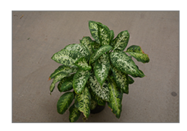
Dumbcane in full

A popular indoor plant that is easy to grow; an excellent, upright growth habit makes it a great accent near furniture or in open corners; lush foliage with great texture and beautiful coloring make the perfect addition to low light rooms