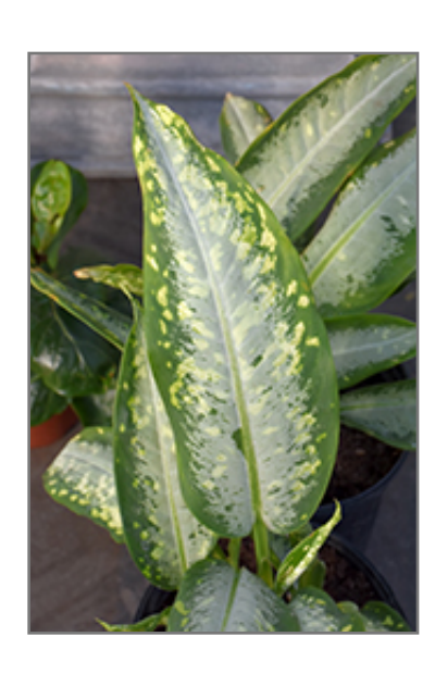
Panther Dieffenbachia foliage

When grown indoors, Panther Dieffenbachia can be expected to grow to be about 5 feet tall at maturity, with a spread of 3 feet. It grows at a medium rate, and under ideal conditions can be expected to live for approximately 10 years. This houseplant performs well in both bright or indirect sunlight and strong artificial light, and can therefore be situated in almost any well-lit room or location. It does best in average to evenly moist soil, but will not tolerate standing water. The surface of the soil shouldn't be allowed to dry out completely, and so you should expect to water this plant once and possibly even twice each week. Be aware that your particular watering schedule may vary depending on its location in the room, the pot size, plant size and other conditions; if in doubt, ask one of our experts in the store for advice. It is not particular as to soil type or pH; an average potting soil should work just fine. Be warned that parts of this plant are known to be toxic to humans and animals, so special care should be exercised if growing it around children and pets.