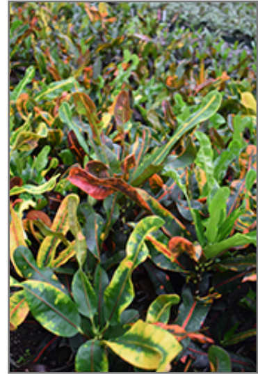
Mammy Croton in full

This is a dense herbaceous evergreen houseplant with an upright spreading habit of growth. Its wonderfully bold, coarse texture is quite ornamental and should be used to full effect. This plant should not require much pruning, except when necessary to keep it looking its best.