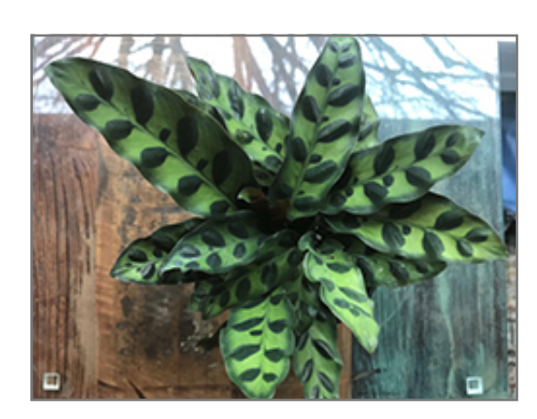
Rattlesnake Plant foliage