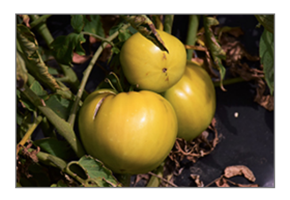
Great White Tomato fruit