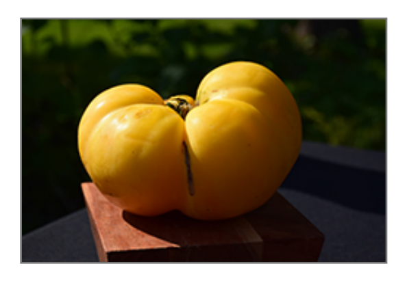
Great White Tomato fruit