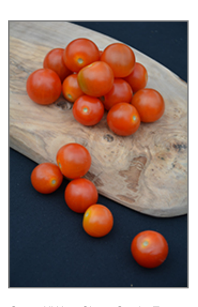
Sweet N' Neat Cherry Scarlet Tomato fruit

A beautiful, extra compact variety, producing clusters of scarlet cherry tomatoes; sweet and flavorful, perfect for snacking, salads and roasting; superb performance in patio containers, window sills and hanging baskets