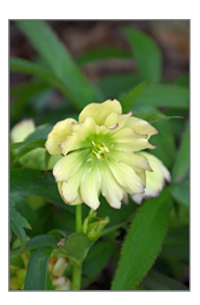
Wedding Party First Dance Hellebore flowers

This attractive variety produces vigorous mounds of thick evergreen leaves; flower stalks, held occasionally above the foliage, bear showy yellow flowers with maroon accents; an outstanding selection for shade gardens