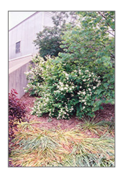
Sweet Mockorange in bloom