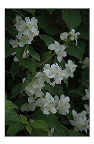
Sweet Mockorange flowers