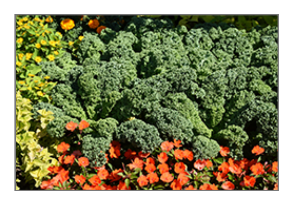
Prizm Kale

A stunning compact selection with its bright green, tightly ruffled edible leaves; regrows leaves quick; cool weather performer; perfect for containers and gardens; tender leaves have a distinct nutty flavor; great for salads, soups and stews