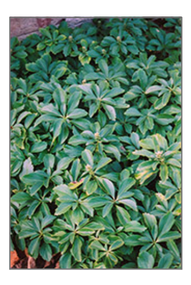
Japanese Spurge foliage