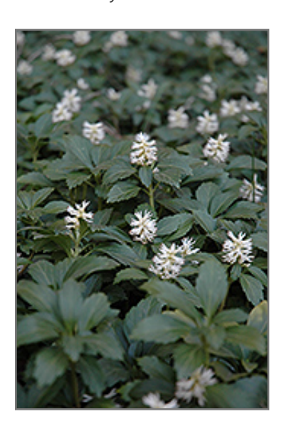
Japanese Spurge flowers