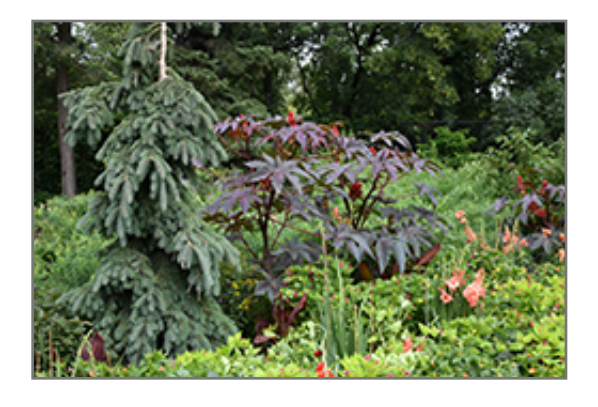
Castor Bean

This is a high maintenance plant that will require regular care and upkeep, and should be cut back in late fall in preparation for winter. It has no significant negative characteristics.