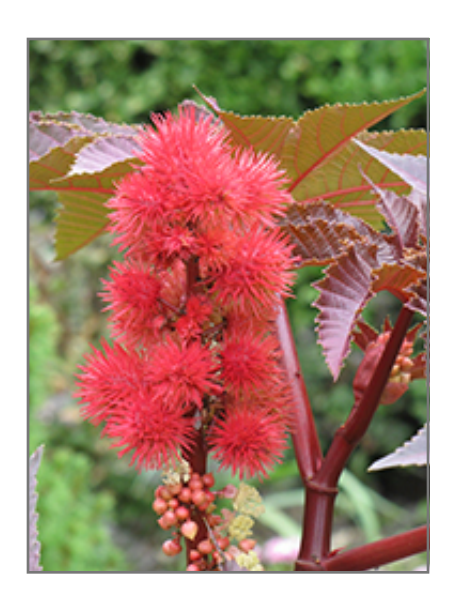
Castor Bean flowers

Castor Bean is an herbaceous annual with an upright spreading habit of growth. Its wonderfully bold, coarse texture can be very effective in a balanced garden composition.