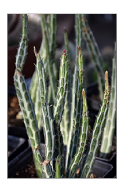
Pickle Plant foliage

Pickle Plant's attractive succulent narrow leaves emerge light green, turning grayish green in colour with showy dark green variegation and tinges of silver throughout the year on a plant with an upright spreading habit of growth. It features dainty clusters of red star-shaped flowers with orange overtones held atop the stems in mid summer.