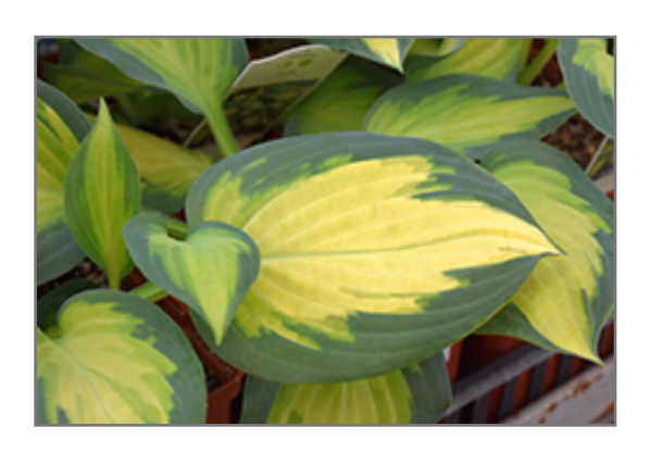
Forbidden Fruit Hosta foliage

An attractive creamy yellow leaf center with a hint of orange, and wide, irregular blue-green margins; leaves are well rounded with good substance; presents spikes of lavender flowers in mid-summer