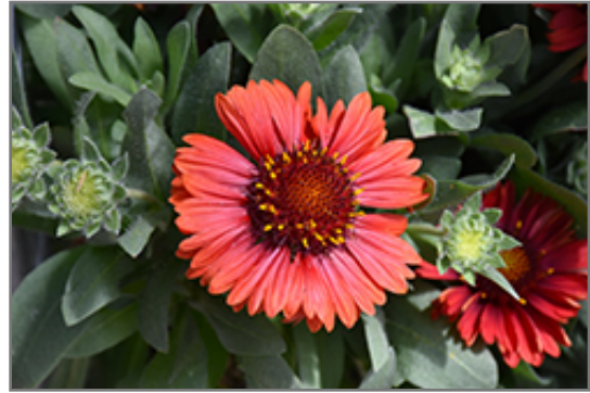
Spintop Red Blanket Flower flowers

Spintop Red Blanket Flower is recommended for the following landscape applications;