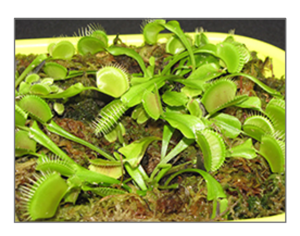
Venus Flytrap

An interesting native carnivorous plant that traps insects with specially adapted leaves; best in consistently moist soil, with strict cultural care provided; as a houseplant, sun, humidity, and a period of winter dormancy must be provided