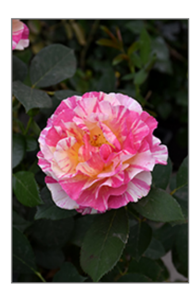
Maurice Utrillo Rose flowers

A stunning hybrid tea rose featuring large, paint splashed, red and white blooms with golden-orange centers; short and compact with excellent disease resistance; an excellent cut flower