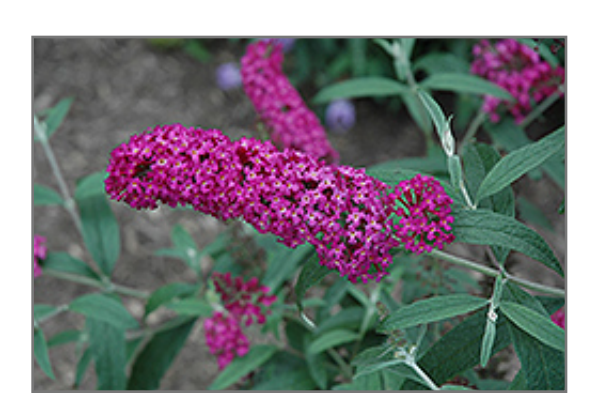
Buzz Magenta Butterfly Bush flowers

A compact garden plant with glowing magenta flowers in summer when little else blooms; attracts butterflies; may be cut back to ground each spring; perfect for smaller garden spaces or patio containers