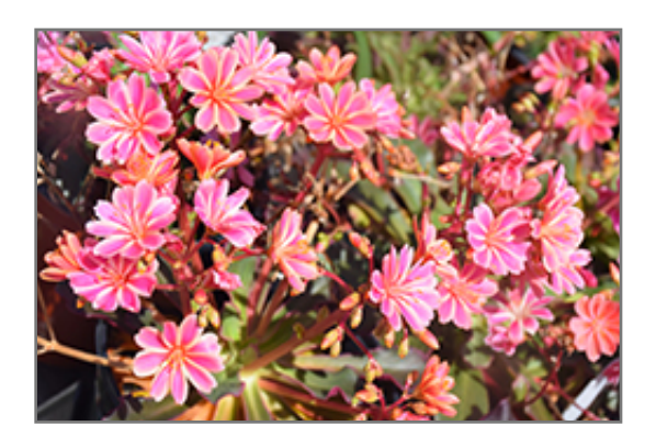
Rainbow Mix Bitterroot flowers