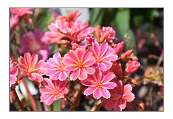
Rainbow Mix Bitterroot flowers

Rainbow Mix Bitterroot has hot pink star-shaped flowers with purple overtones and yellow streaks at the ends of the stems from late spring to mid summer, which are interesting on close inspection. Its attractive succulent oval leaves emerge light green in spring, turning dark green in colour the rest of the year.