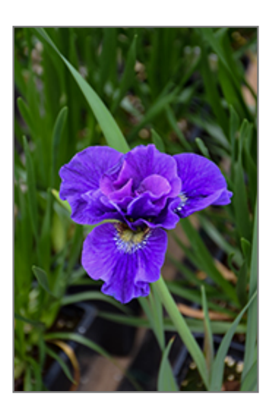
Concord Crush Siberian Iris flowers

An unusual, attractive variety presenting ruffled, violet blue double blooms; massed plantings give the best effect in a garden; blooms from late spring into the summer, and possibly again later; best in full sun and moist soil, but very adaptable