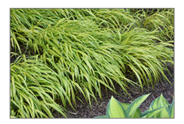
Stripe It Rich Hakone Grass