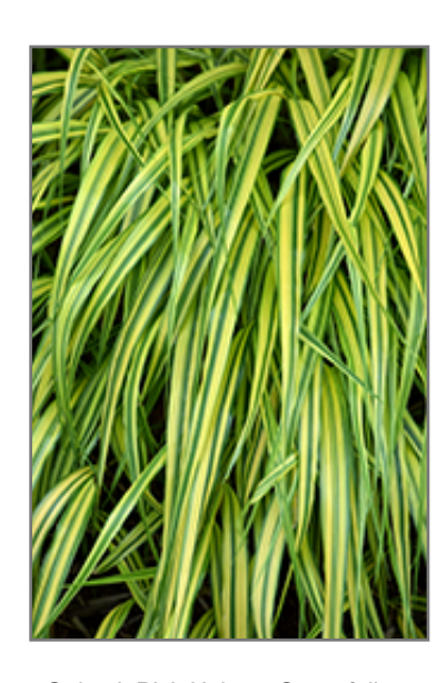
Stripe It Rich Hakone Grass foliage