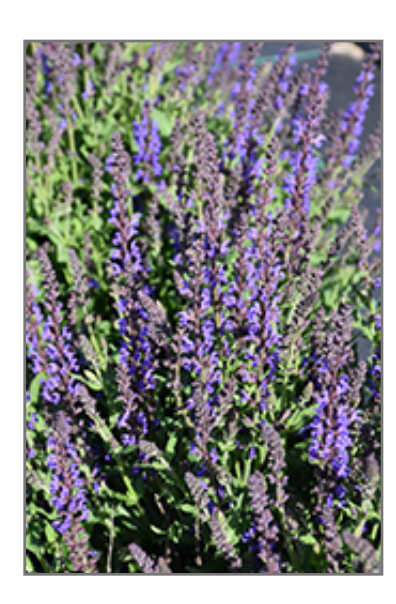
Spring King Meadow Sage flowers

A compact, early blooming variety producing stunning spikes of long lasting purple-blue flowers; deadhead faded blooms for extended garden color; drought tolerant once established; excellent for the sunny border or containers