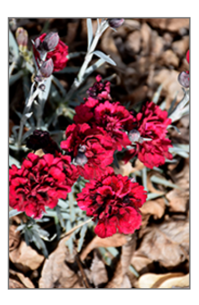
Odessa Red Pinks flowers

Impressive, frilly double flowers are deep crimson red with lighter red edges, above mounds of fine foliage; great for flower arrangements; deadhead to rebloom; pair up with summer blooming perennials and annuals to time a continued flower display