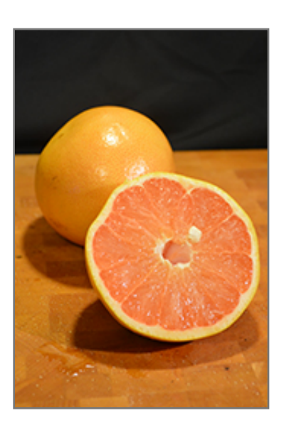
Ruby Red Grapefruit fruit and flesh

Ruby Red Grapefruit features showy clusters of fragrant white star-shaped flowers with buttery yellow eyes at the ends of the branches in early spring. Its attractive glossy oval leaves emerge chartreuse, turning dark green in colour throughout the year. The orange round fruit is edible and has a tangy taste. Note that in general, it can be difficult to get plants to reliably produce fruit indoors; this may be a challenge best reserved for adventurous and experienced gardeners.