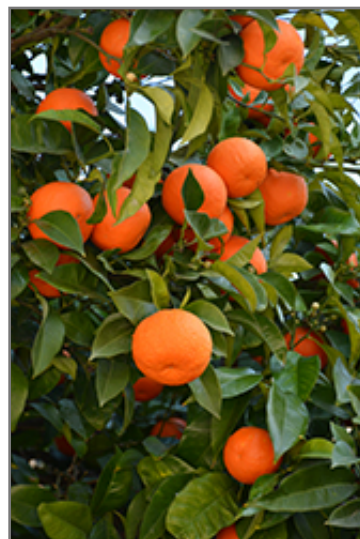
Valencia Orange fruit

When grown indoors, Valencia Orange can be expected to grow to be about 7 feet tall at maturity, with a spread of 6 feet. It grows at a medium rate, and under ideal conditions can be expected to live for approximately 50 years. This houseplant will do well in a location that gets either direct or indirect sunlight, although it will usually require a more brightly-lit environment than what artificial indoor lighting alone can provide. It does best in average to evenly moist soil, but will not tolerate standing water. The surface of the soil shouldn't be allowed to dry out completely, and so you should expect to water this plant once and possibly even twice each week. Be aware that your particular watering schedule may vary depending on its location in the room, the pot size, plant size and other conditions; if in doubt, ask one of our experts in the store for advice. It is not particular as to soil type or pH; an average potting soil should work just fine.