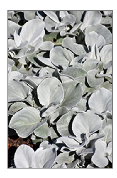
Angel Wings Senecio foliage

A beautiful, striking variety producing heart shaped, silvery-white foliage that is soft to the touch, with toothy edges; grown primarily for foliage, trim flower stems to promote new basal growth; an excellent indoor accent plant