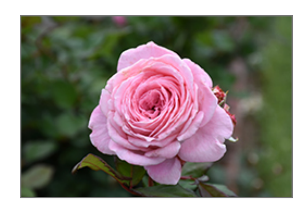
Summer Romance Parfuma Rose flowers

Elegant, cup shaped, intensely fragrant pink blooms appear throughout the season on a low bushy shrub; well suited for landscaping, for containers, or a flowering hedge